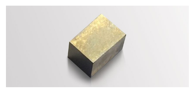
Initial CVD block

Creating CVD seeds for new diamond growth