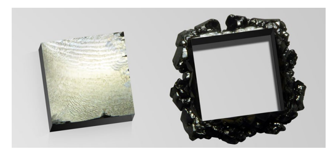
CVD block after coring process