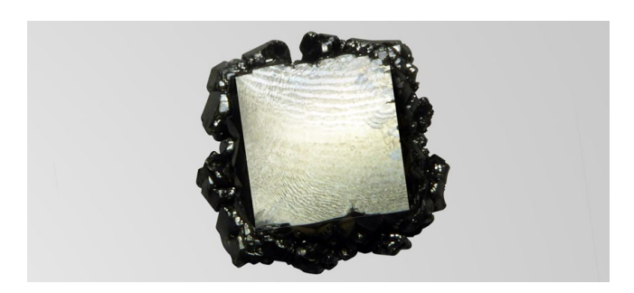
Grown CVD crystal

Removing graphite around single crystal core or grown clusters with multiple crystals