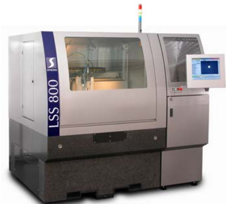
Laser Stencil System 800

The machine has a precision of +/- 5 microns, large processing areas (630 x 850 mm, 800 x 1000 mm, or even 1000 x 1200 mm) a maximum axis velocity of 1000 mm/s. The system is equipped with a CCD camera and fast image treatment software, allowing automatic alignment and inspection.